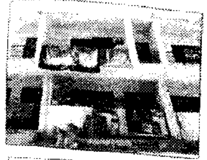
PHOTO OF THE PROPERTY

Plot No. 9 paiki its land admeasuring Sq. Mts. 16.900 and Plot No. 11 paiki its land admeasuring Sq. Mts. 19.160 (Portion No. 9/11-H) its total land admeasuring Sq. Mts. 36.060 with existing structure thereon and bounded as under